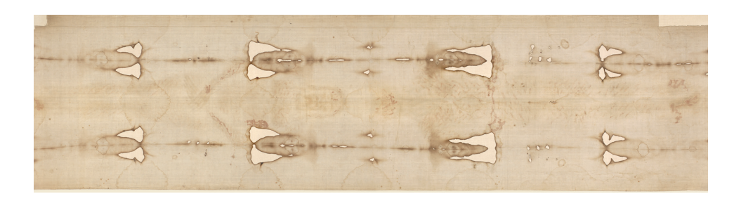
FIGURE 2 | Shroud of Turin. Cathedral, Turin.