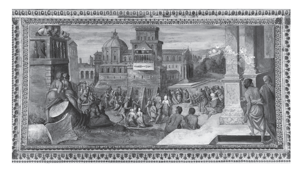
FIGURE 1 | Girolamo and Ignazio Danti, Ostension of the Shroud of Turin, 1583. Galleria delle Carte Geografiche, Vatican City.