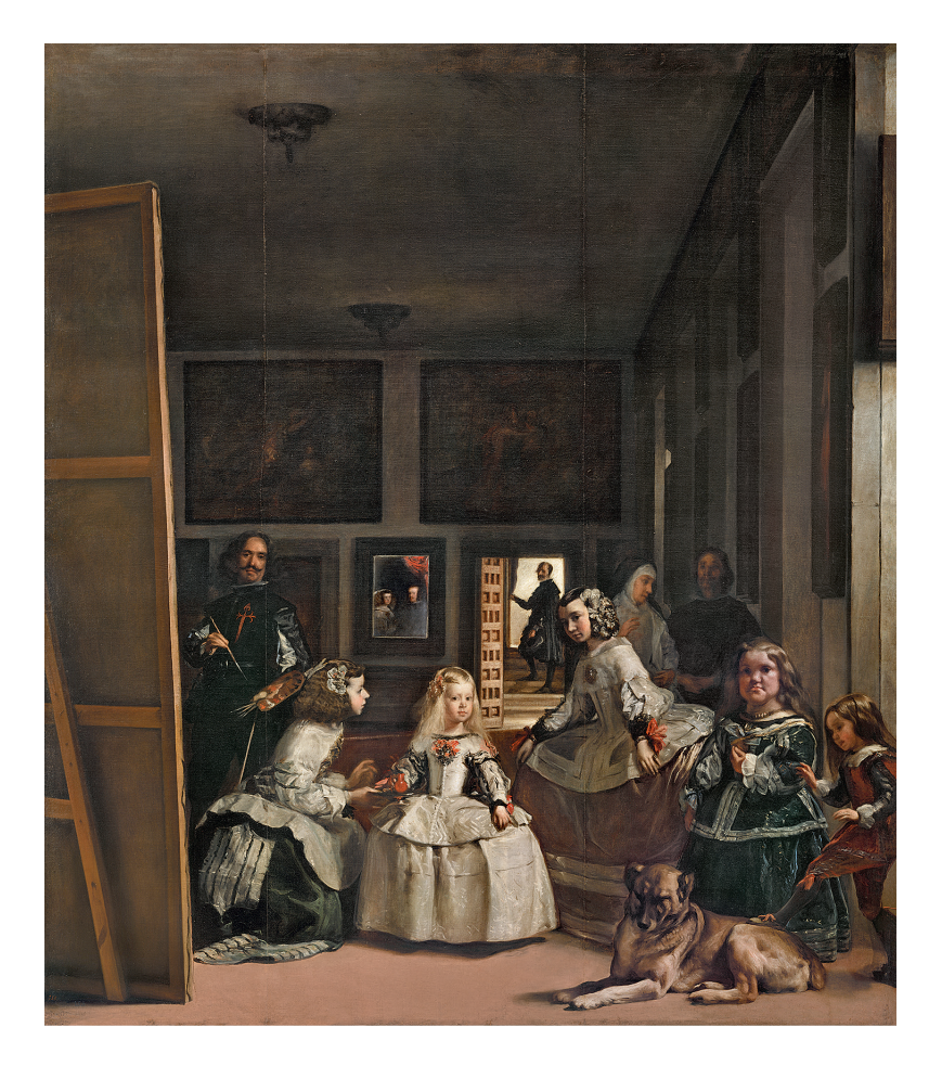
Figure 3 Diego Velázquez, Las meninas , 1656. Oil on canvas, 10 ft. 6 <sup>3</sup>/<sub>8</sub> in. × 9 ft. 2 <sup>1</sup>/<sub>2</sub> in. (321 × 281 cm). Museo Nacional del Prado, Madrid, P001174.

left middle ground, the artist himself moves back from his canvas to take in the arrival of an unseen visitor or visitors who occupy the same space as the viewer. Reflected in the distant mirror are the queen and king, Mariana of Austria (1634–1696; regency, 1665–75) and Philip IV. Velázquez captures a private moment, one in which the royal family and their servants can hardly be more removed from the city around them. Yet the individuals pictured in Las meninas often left the Royal Palace and moved through the streets and public