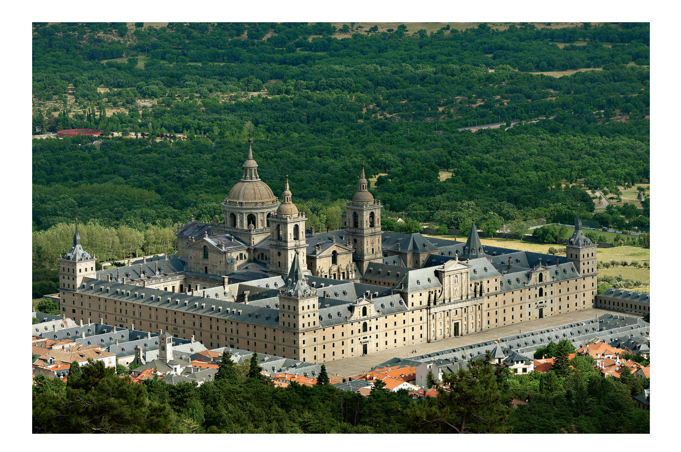
Figure 2 Juan Bautista de Toledo, Juan de Herrera, and others, Monastery of San Lorenzo el Real, El Escorial, 1563–84, aerial view from the southwest.

Much of what had been built since 1561 was erected quickly owing to the necessity of housing the court and its vast bureaucracy as efficiently as possible. In 1628, only seven years into Philip IV's reign, Madrid's municipal leaders began to draw up a plan of the city's limits and subsequently erected a nondefensive wall to curb growth.<sup>4</sup> Although that wall would have to be repaired in 1642, building in the capital rarely surpassed its limits as municipal and court builders reshaped the city's architectural profile.