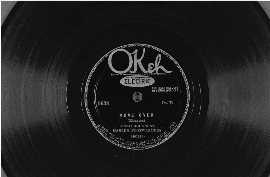
FIG. 1 Lonnie Johnson's Harlem Footwarmers, "Move Over," Okeh 8638.

nonexistent. 7 Second, information provided in interviews with both Johnson and others is also unreliable. Because of a variety of factors, ranging from faulty memory to a desire to project a particular image to a specific audience, information provided in interviews may be inconsistent, difficult to corroborate, or even easily falsifiable, especially dates, places, and time intervals. 8 Always aware of the performance entailed in all forms of social interaction, when speaking to white blues and jazz scholars, critics, record collectors, and fans, at different stages in his career, Johnson produced different narrative accounts of his life. But just because information provided in interviews is not 100 percent factually accurate does not mean it does not contain elements of truth. Research in neuroscience suggests that memory is always a kind of reworking of the past, particularly as it involves autobiography. As people remember events, they piece together bits of information from the past and often move them to different spatial and temporal locations, modifying and rewriting rather than preserving exactly. 9 In Johnson's case, racialized power relations tied to reception, as well as financial interest, further complicate an already complex dynamic. Rather than look to interviews for verification of facts, I rather read them as containing a kind of truth about his life and