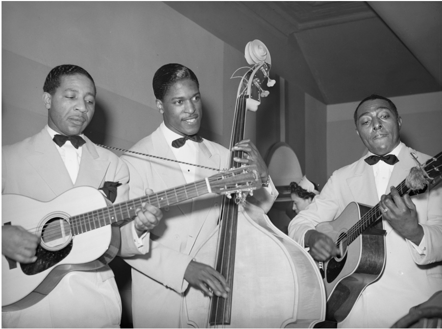
FIG. 2 “Entertainers at Negro Tavern,” Chicago, April 1941 (Lonnie Johnson on far left).

on East 51st Street and then at Square’s at 931 West 51st Street—I was there about five years, something like that. Then I went into the Flame Club at 3020 South Indiana.” 67 The mention of Warren “Baby” Dodds and the names and locations of the venues signal that he was performing jazz. A photo taken by Russell Lee for the Farm Security Administration in 1941 documents a two-guitar and double bass combo (fig. 2). Nighttime work in clubs supplemented meager earnings from daytime recording sessions, as it always had.